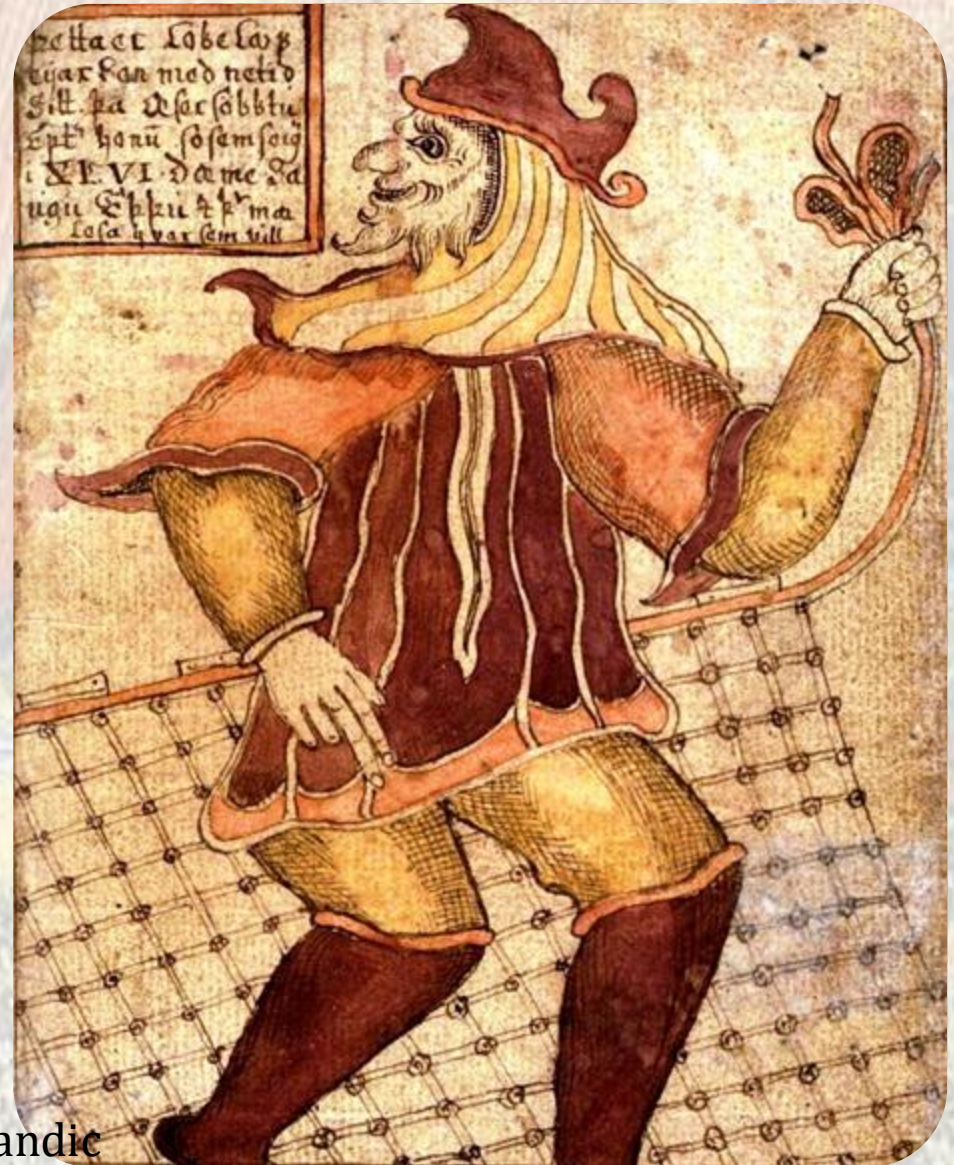
Loki (in old Icelandic manuscript)