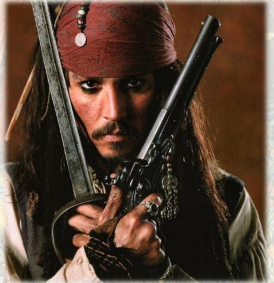
Johnny Depp as Captain Jack Sparrow (Pirates of the Caribbean)