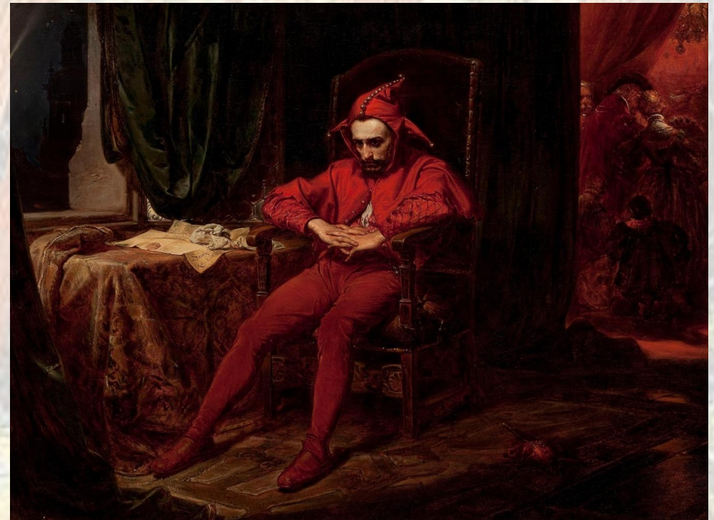
Jan Matejko, Stańczyk