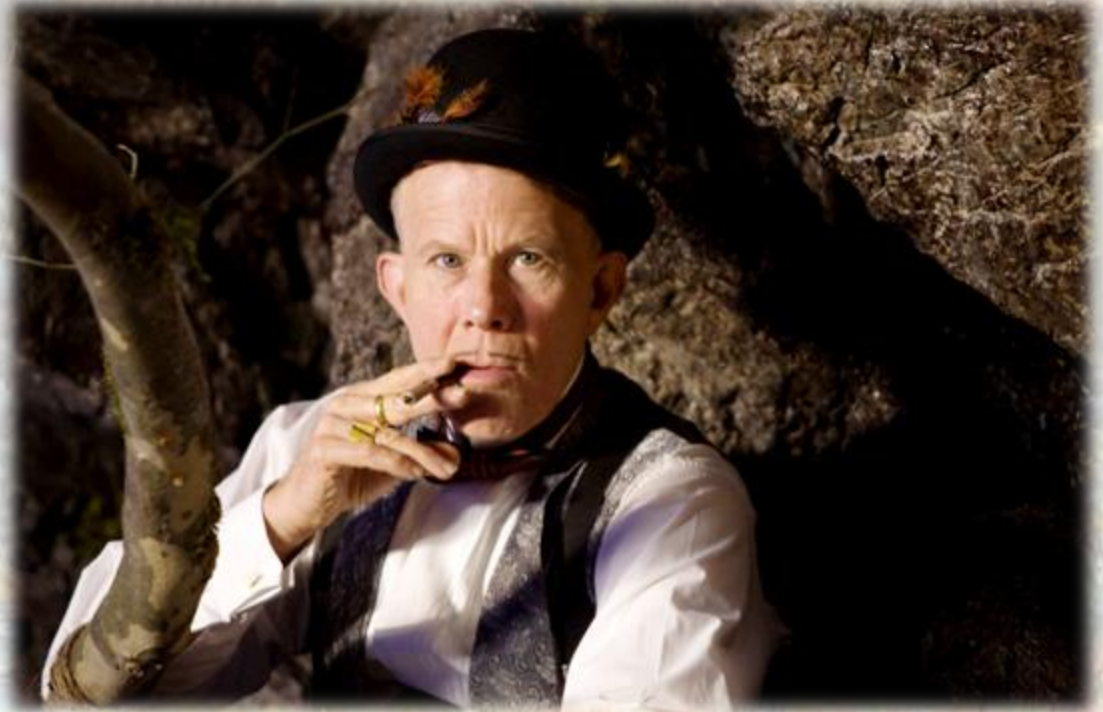
Tom Waits as the Devil in The Imaginarium of Dr. Parnassus (directed by Terry Gilliam)