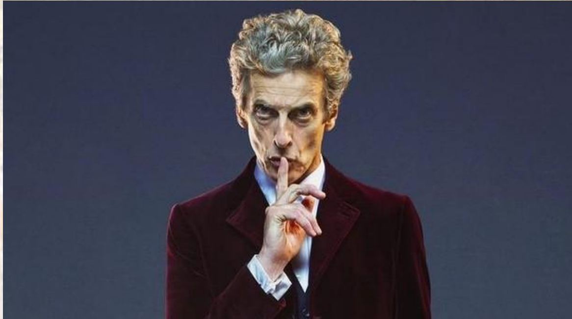
Peter Capaldi as the Doctor in Doctor Who BBC series

Some people will have an inherent propensity to creative thinking. It is all about motivation. It is the difference between enjoying possibilities and only being happy with certainties. Our methods and message are uncomfortable for some people, whereas a creative person loves exploring possibilities – it can be an emotional experience (Edward de Bono)