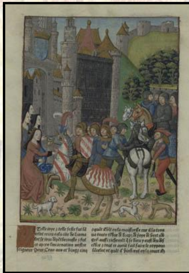
Sir Lancelot, illumination from Lancelot Romance

Adventure is a risky path and an endeavor bordering on the impossible. Mental and physical challenge for the protagonist. The goal is to overcome difficulties and gain experience. The reward is greater than any material benefits, e.g. the Holy Grail.