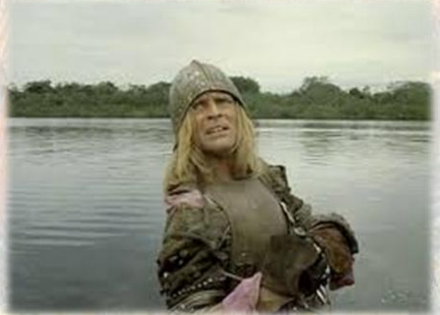
Klaus Kinski as Aguirre, in Aguirre, the Wrath of God directed by Werner Herzog