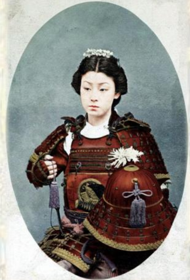
Onna bugeisha, kobieta samuraj, XIX wiek