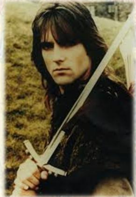
Michael Praed as Robin Hood in Robin of Sherwood