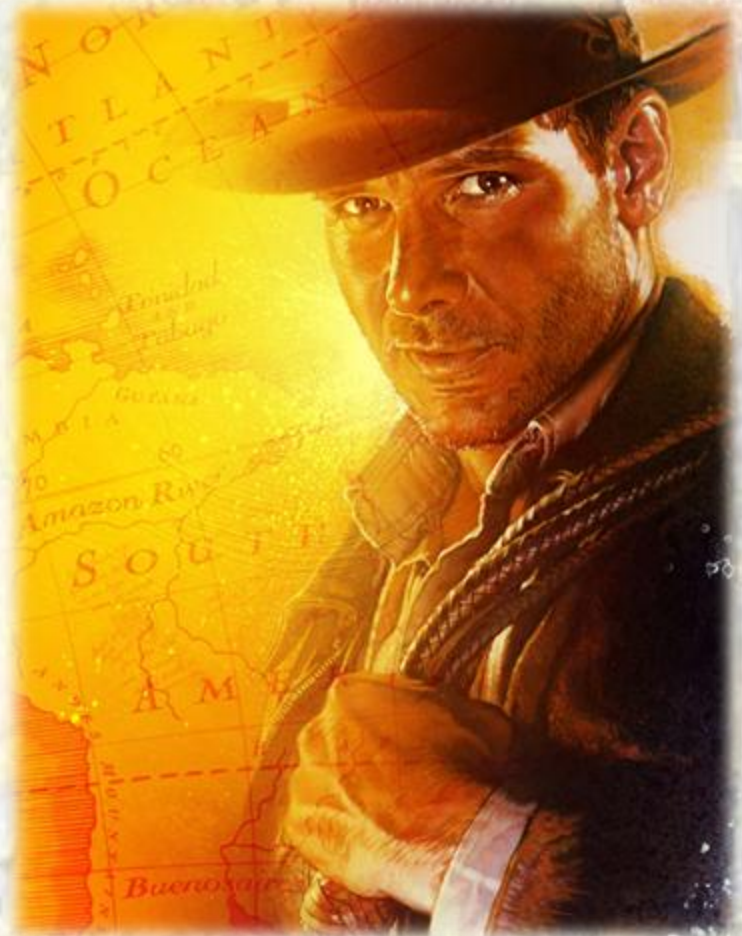
Harrison Ford as Indiana Jones, Riders of the Lost Ark