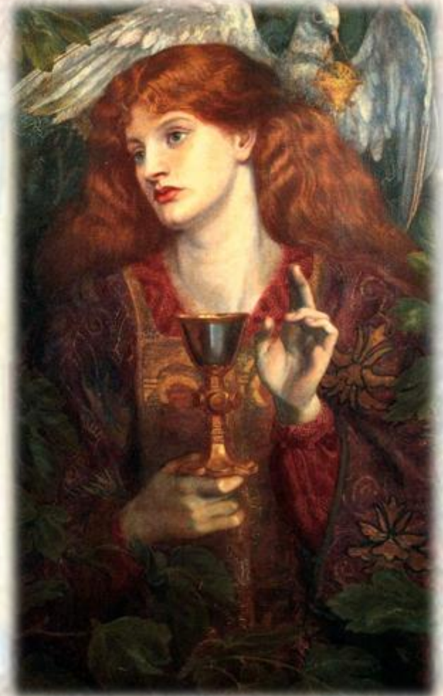
The Damsel of the Sanct Grael, Dante Gabriel Rossetti