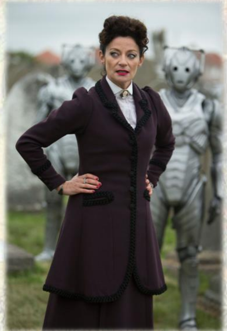
Michelle Gomez as Missy in Doctor Who