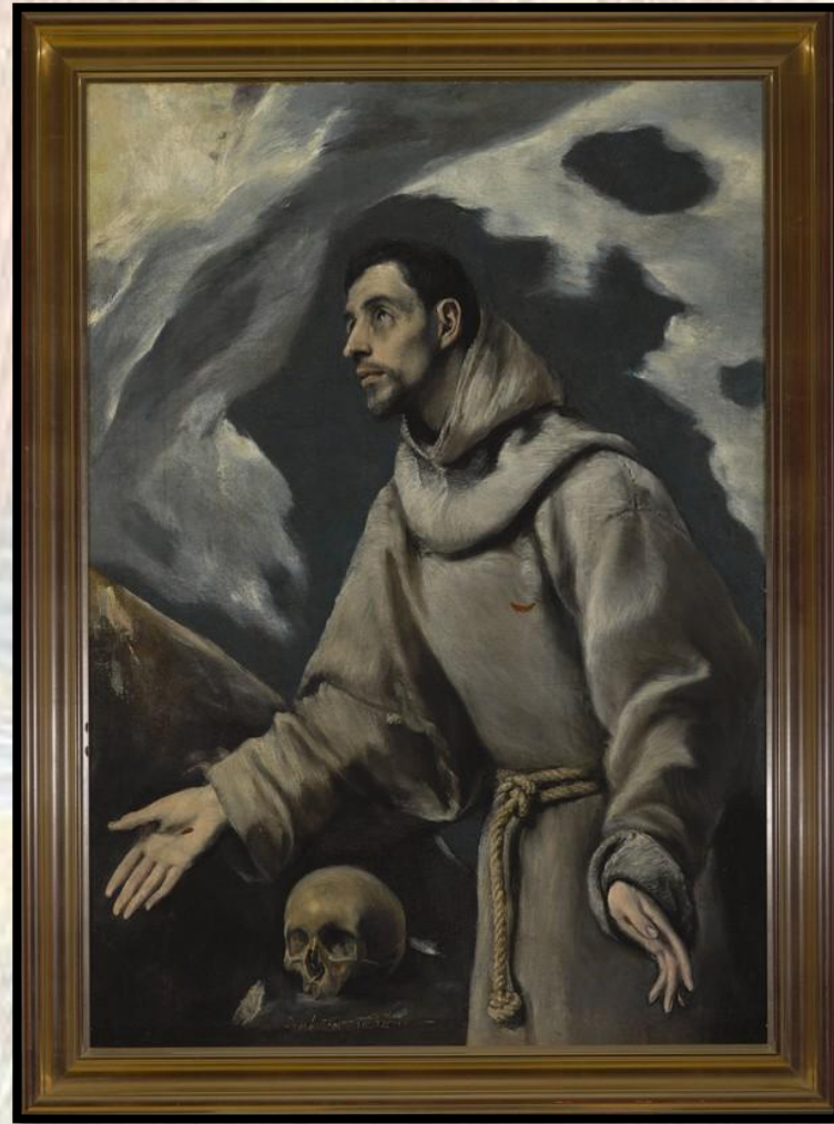
St. Francis of Assisi, El Greco