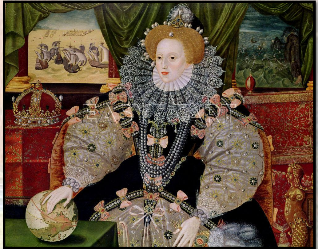
Queen Elizabeth I by George Gower