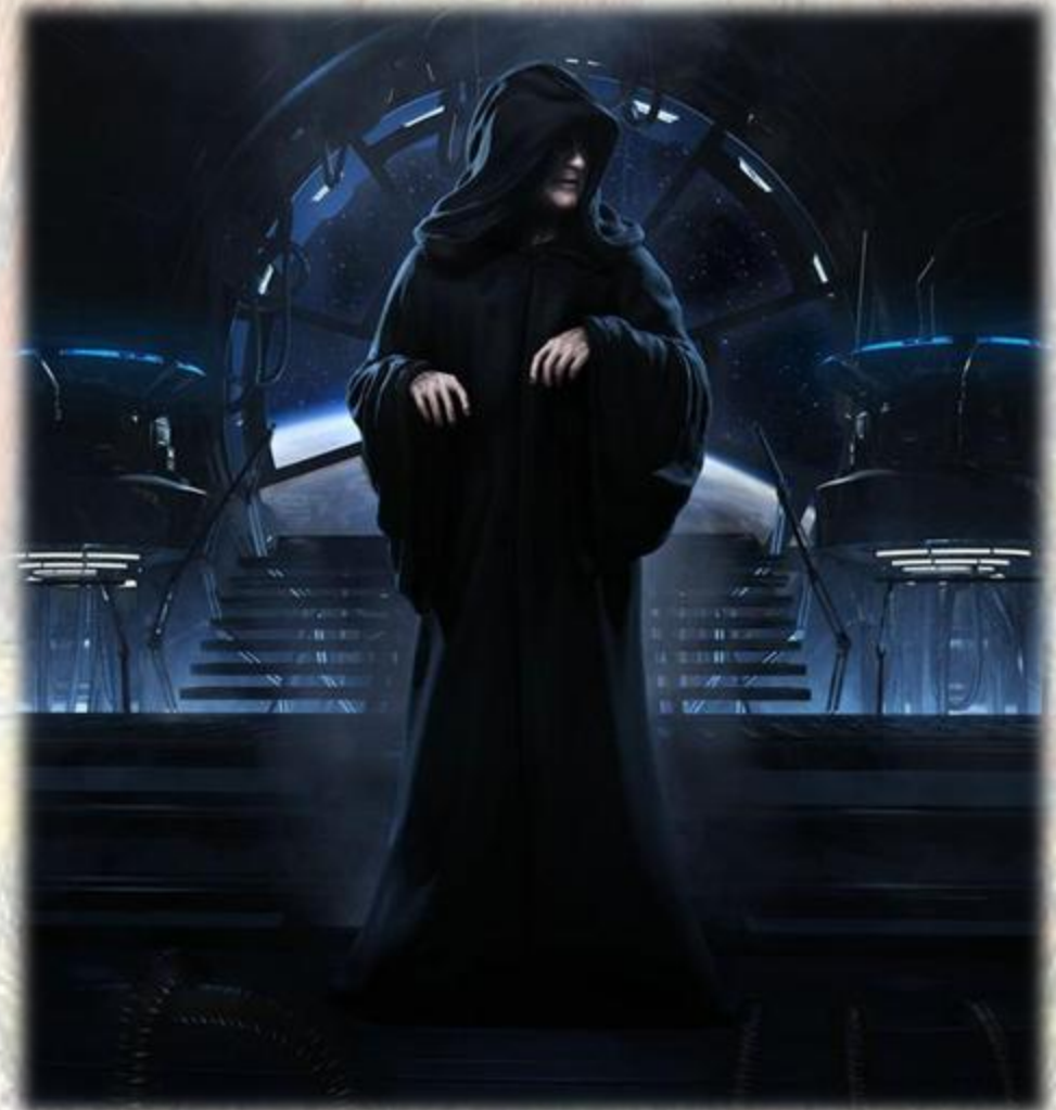
Palpatine, or Darth Sidious, from Star Wars