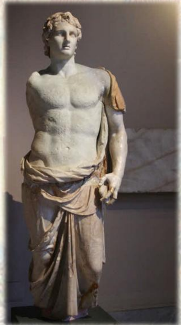
Statue of Alexander the Great, Istanbul Archeological Museum