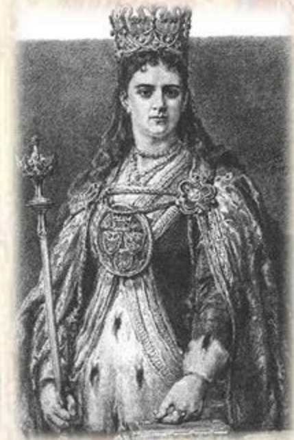
Jan Matejko, Jadwiga Andegaweńska