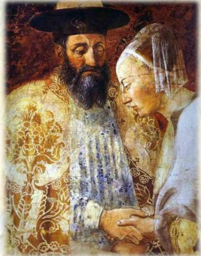
King Solomon and the Queen of Sheba, by Piero della Franesca