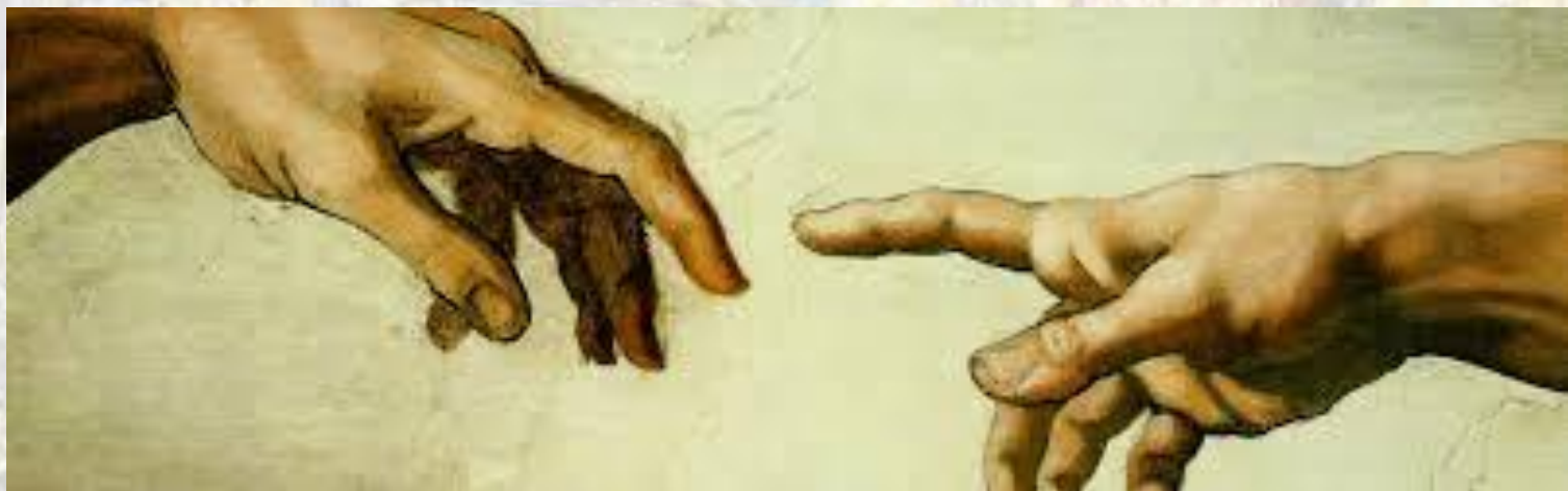
Michelangelo Buonarroti, Creation of Adam (fragment)

The justice of the leader is determined by respect for the alterity of the people she leads, for their absolute otherness; and by the awareness of the Other's difference from oneself