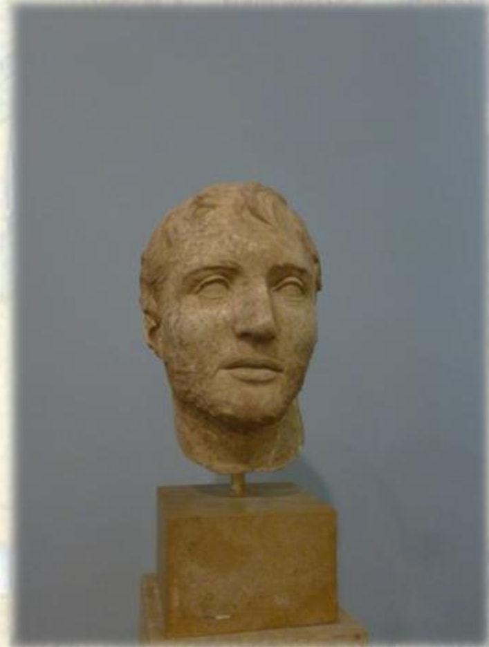
Titus Quinctius Flaminius at the Museum in Delphi

„ Quiet management is about thoughtfulness rooted in experience. Words like wisdom, trust, dedication, and judgment apply. Leadership works because it is legitimate, meaning that it is an integral part of the organization and so has the respect of everyone there. Tomorrow is appreciated because yesterday is honored. That makes today a pleasure” (Henry Minzberg)