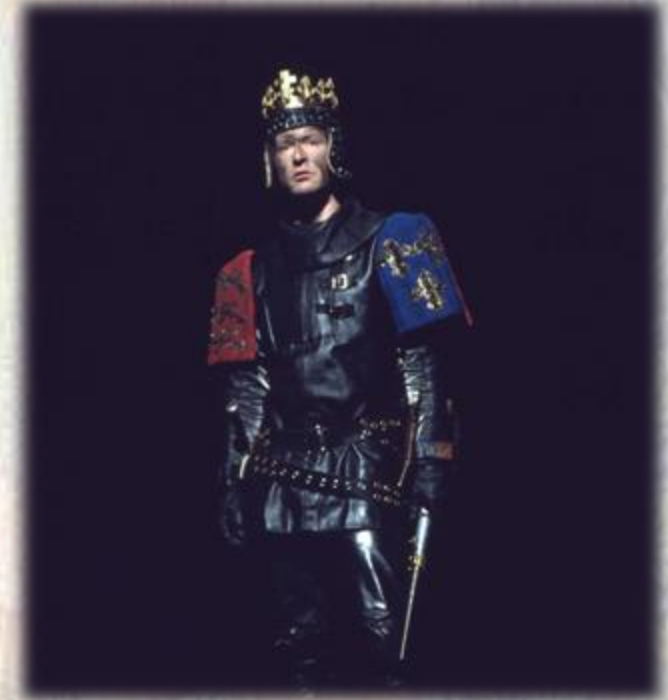
Alan Howard as Henry V in Henry V, 1975

Justice is the mission of a leader; the answer to it determines the ethical quality of leadership