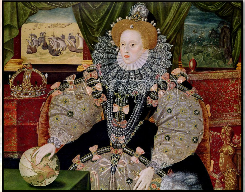
Queen Elizabeth I by George Gower