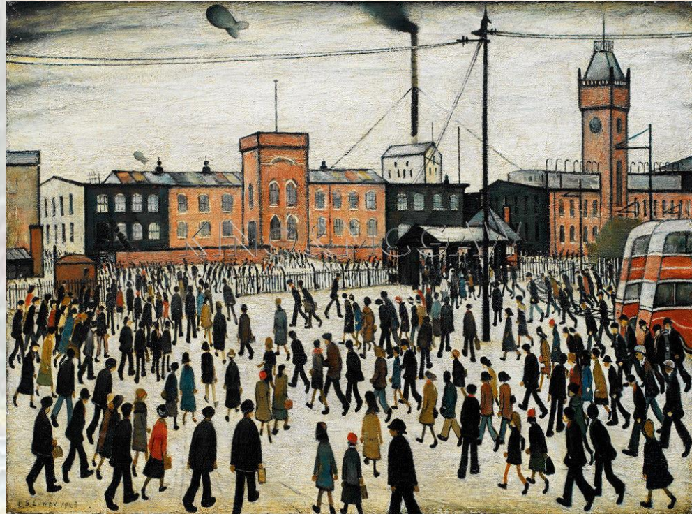
Going to work , by L.S. Lowry