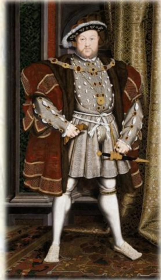
Henry VIII, Workshop of Hans Holbein the Younger