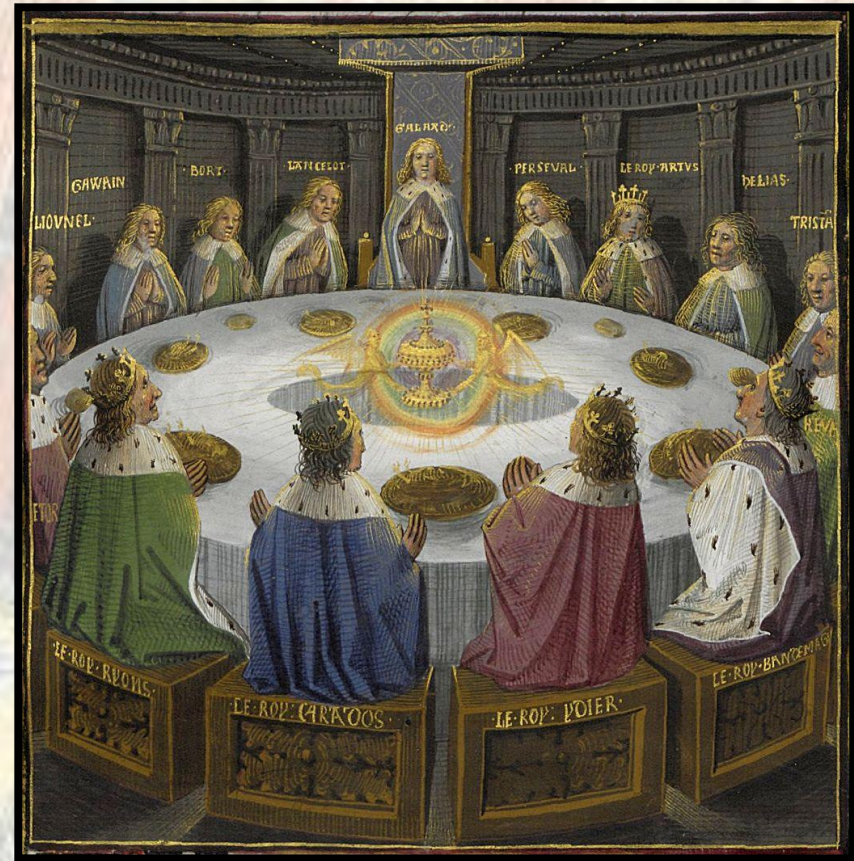
Knights of the Round Table and King Arthur having a vision, by Evrard d'Espingues

Nancy Adler: the contemporary world, full of ugliness, consisting of injustice, abuse and pollution, is in need of beauty. Beautiful management can make the difference by providing solutions worthy of humanity.