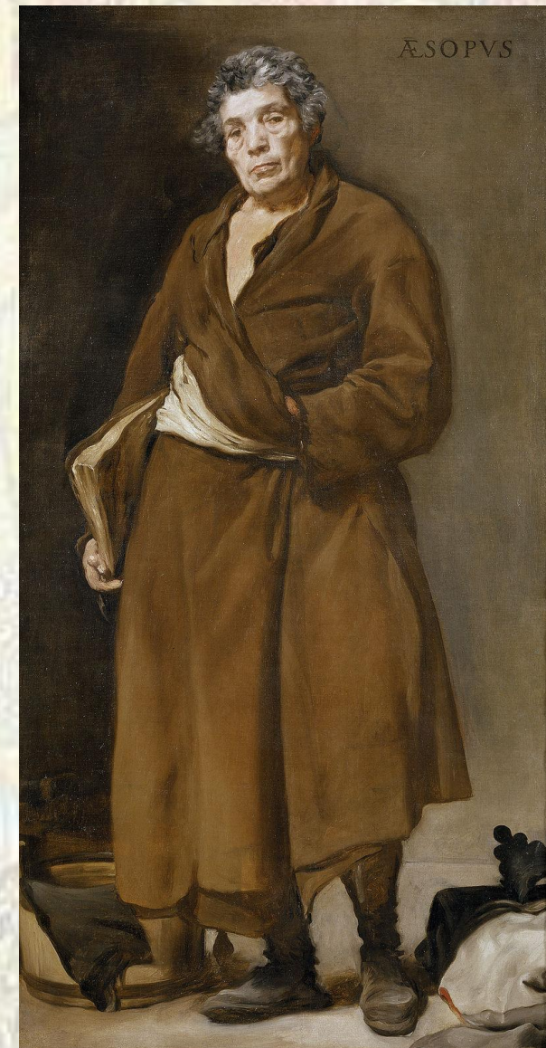
Aesop, by Diego Velázquez

“Because we are only bored with what is new. What is old never becomes boring. When we have something truly old, we are happy ... life is repetition and that is the beauty of life.” (Søren Kierkegaard)