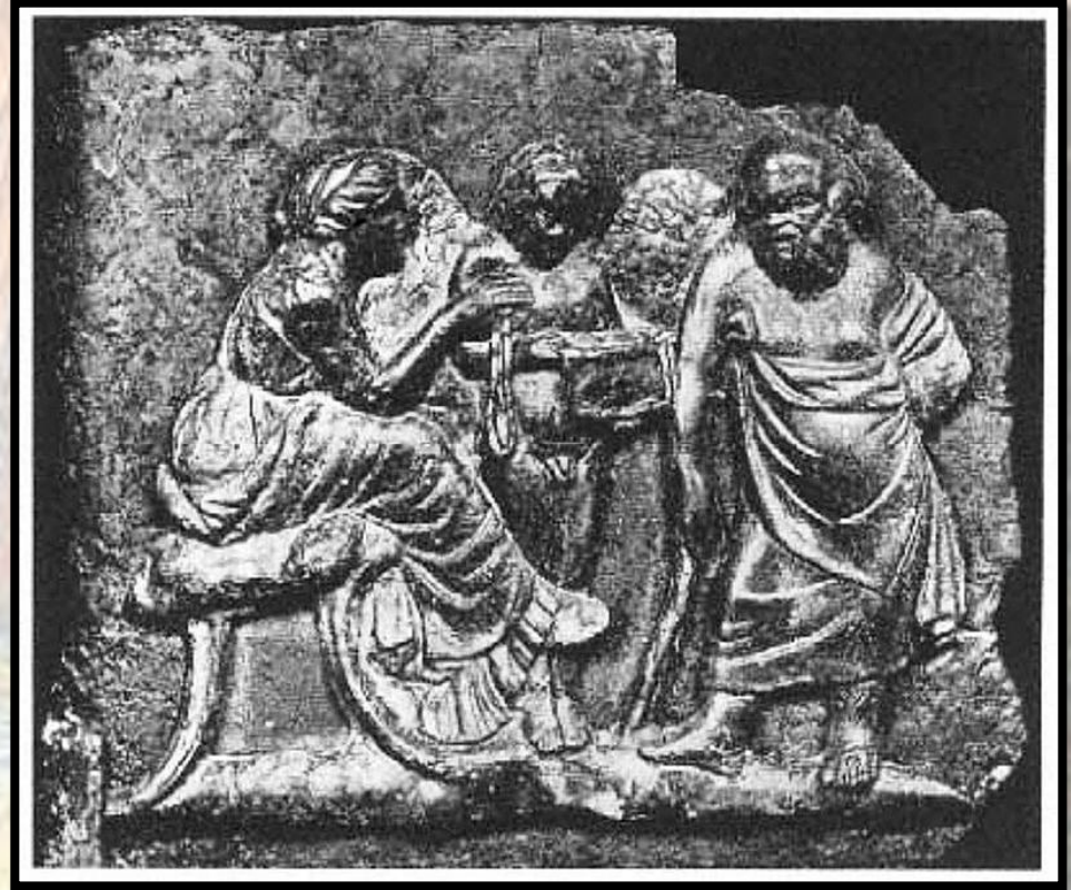
Diotima and Socrates