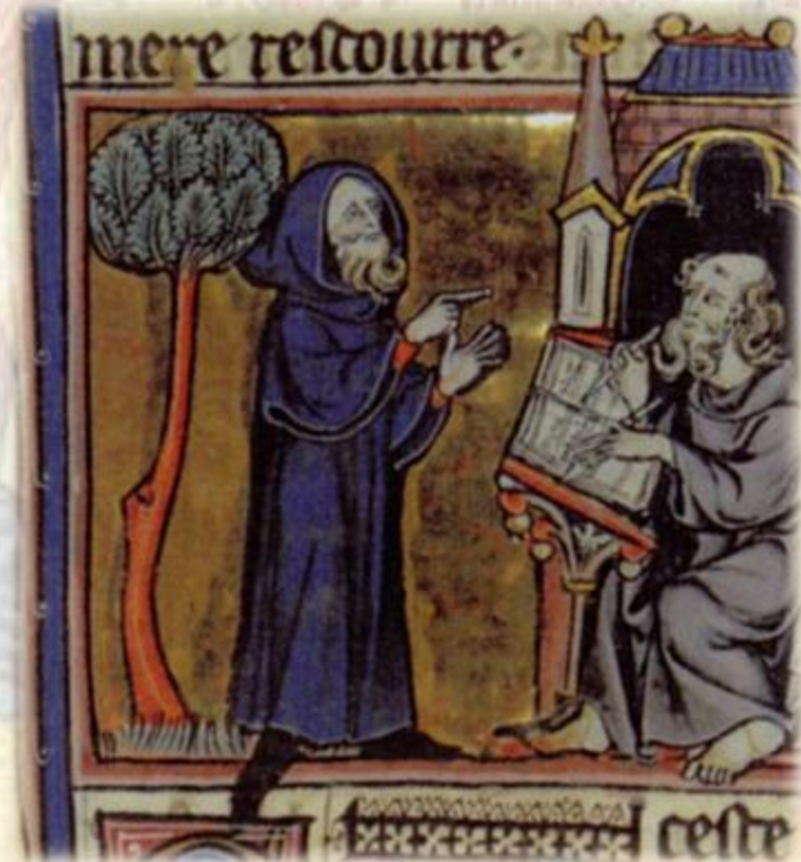
Merlin in 13th century illustration by Robert de Boron