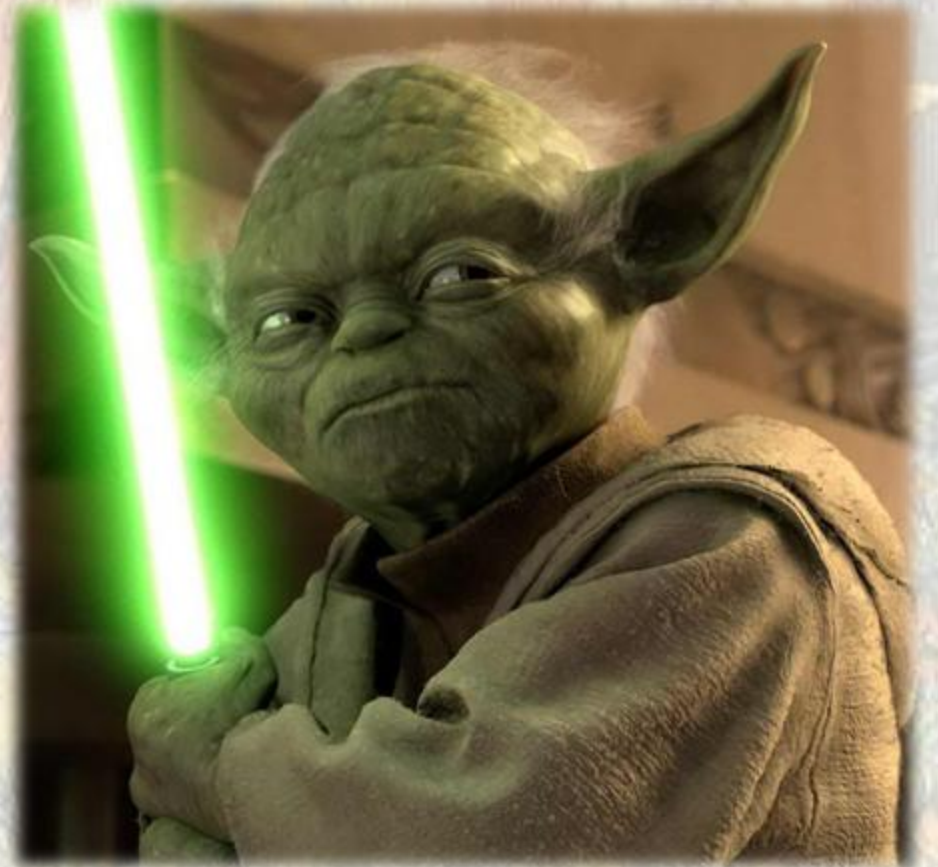
Yoda from George Lucas' Star Wars