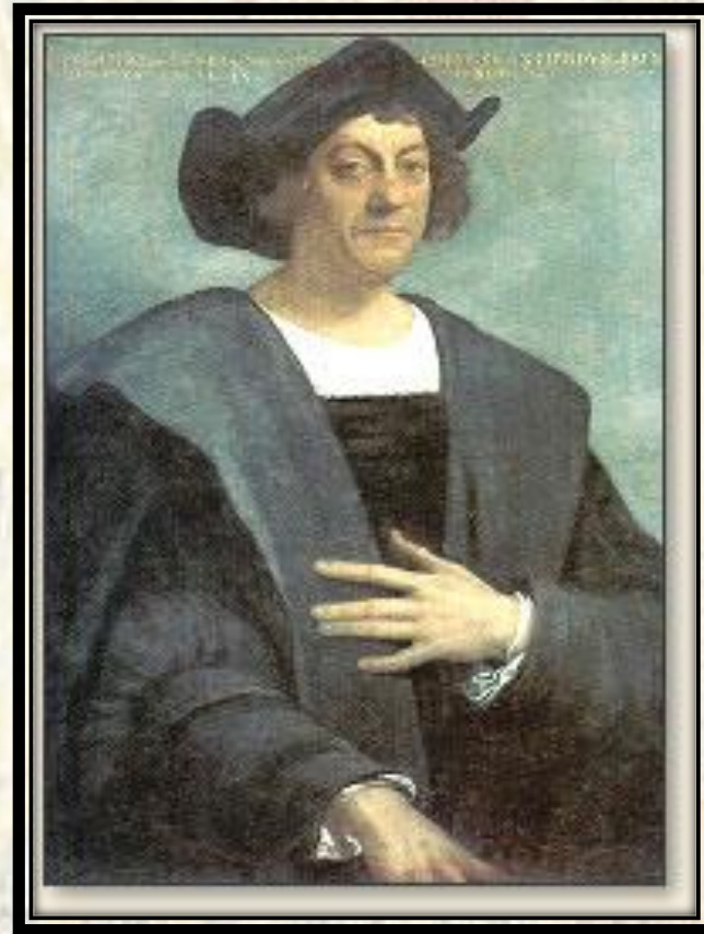
Christopher Columbus by Sebastiano del Piombo