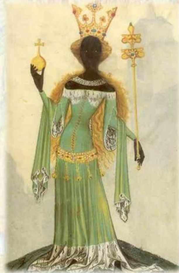
Queen of Saba, Medieval manuscript Bellifortis , Prague