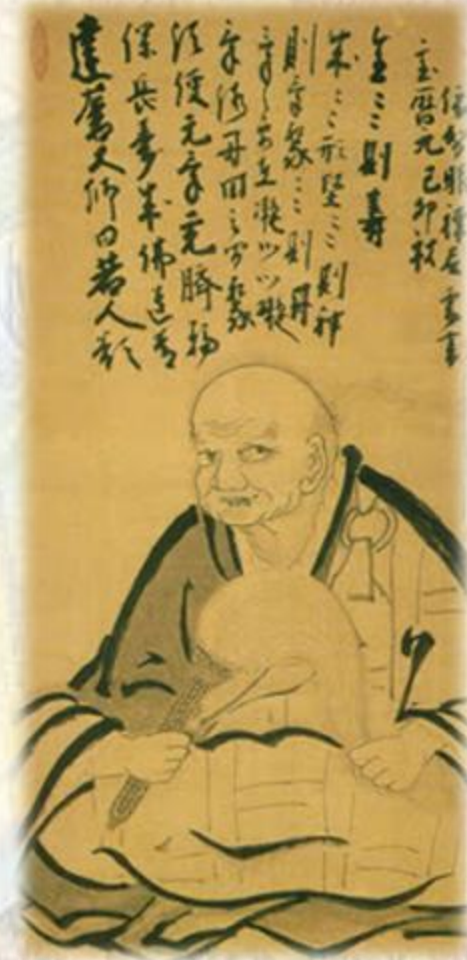
Self-portrait of Zen Master Hakuin

The Senex can use information, experience and knowledge in a way that goes beyond their technical and rational qualities, because wisdom is more than these qualities.