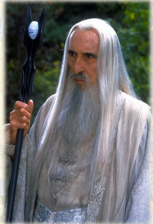
Christopher Lee as J.R.R. Tolkien's Saruman the White