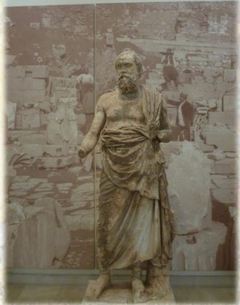
Socrates in the Dephli Museum